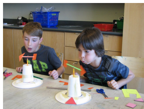
Grade 5 - Testing Weather Vanes