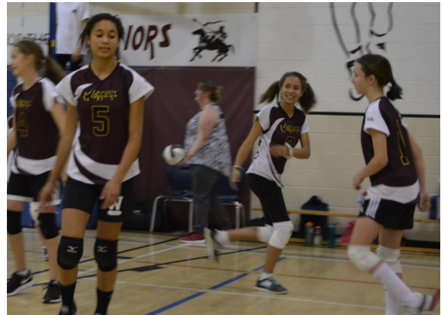
Girls B Volleyball

Next School Council Meeting will be held on Tuesday, November 7 @ 10:00am in room 206 following the Parent Society Meeting. All parents are welcome to join us!