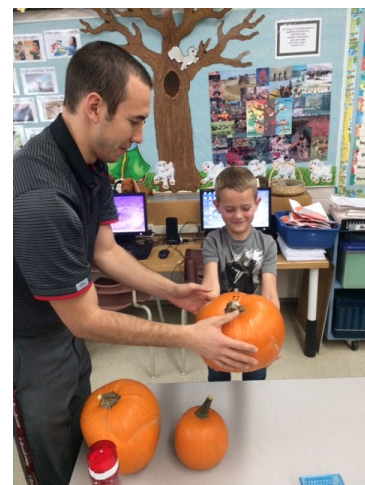
Grade 1- Which pumpkin is heaviest?

"Blessed is he who considers the poor; The Lord will deliver him in time of trouble."